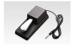
F-10H damper pedal